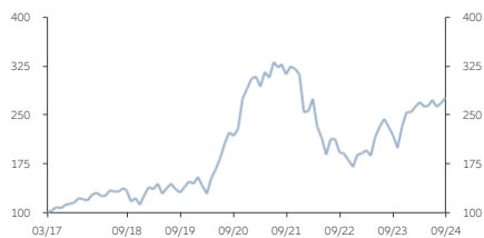
■ Class AT (USD) Acc.