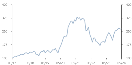
■ Class AT (USD) Acc.