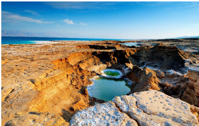
The sinkholes of the Dead Sea It is caused by the loss of water from the giant salt lake. Source: iStock, 20 April 2021

The first sinkholes were exposed in the 1980s and the years the number has increased rapidly. Now there are more than 3000 sinkholes on the banks of the Dead Sea. In the last three decades, the Dead Sea's level has fallen by almost 100 feet. The drying Dead Sea has revealed a serious water shortage. Drought also contributes to the wildfires in Australia and North America.